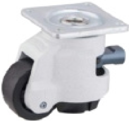
Ø62mm (2½") Nylon Wheel / Plate Level Adjustment Castor RATCHET OPERATED

The CG Levelling castor is suitable for many industrial applications. When your application is in place you can ratchet up and down and the castor lifts off the ground and the polyurethane pad sits on the ground making the application stable.